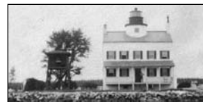
St. Clement's Hundred